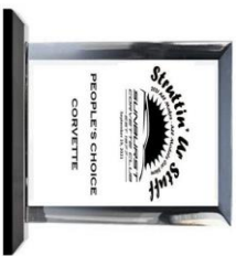
Example of Awards