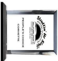
Example of Awards

5220 Northwest Hwy Crystal Lake, IL 60014