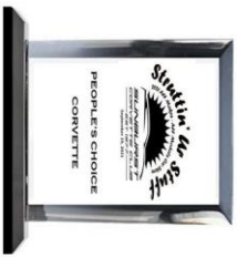
Example of Awards

5220 Northwest Hwy Crystal Lake, IL 60014