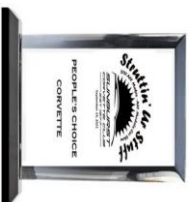
Example of Awards

9:00 AM Registration Opens 12:00 AM Voting Closes 12:30 PM Split the Pot Raffle Awards 1:00 PM Show Closes