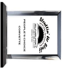
Example of Awards

5220 Northwest Hwy Crystal Lake, IL 60014